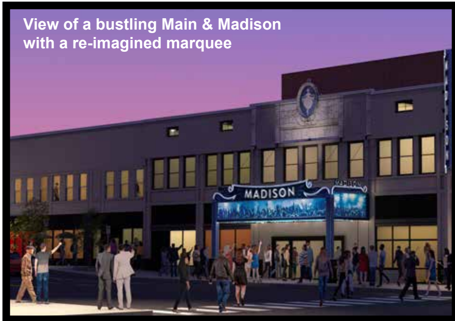
View of a bustling Main & Madison with a re-imagined marquee

Their vision is a beautifully restored historic Madison Theatre and a bustling Main Street – downtown residents slipping in and out of the neighborhood bodega to grab a coffee and snack, businesspeople meeting over lunch at café tables lining the sidewalk, and concertgoers enjoying a cocktail and a delicious meal before the rush of people queue up for the evening concert at The Madison .