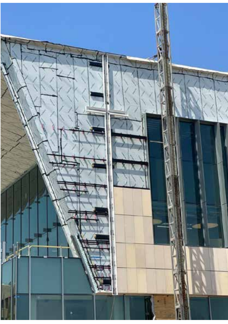
Cross on Cancer Institute - 1